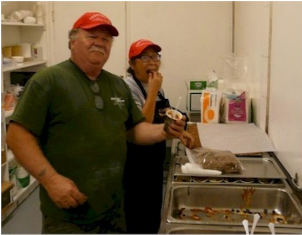
We would all starve without the Stanleys