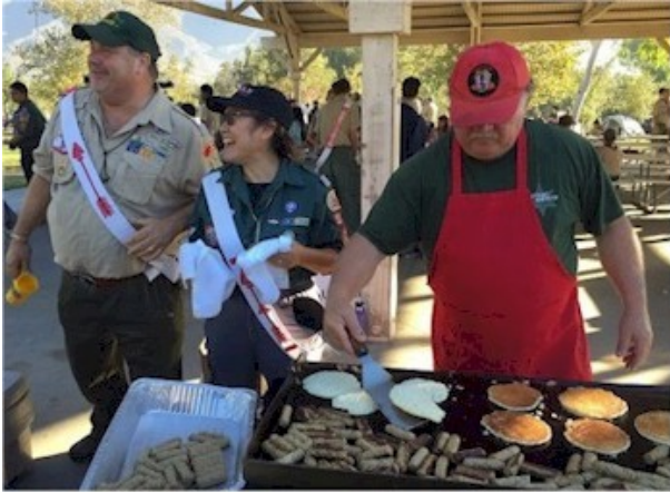
We would all starve....