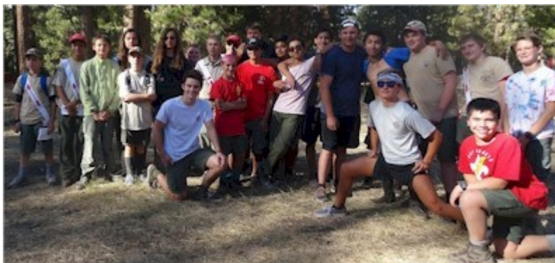
2016 Conclave Lodge Ball Champions