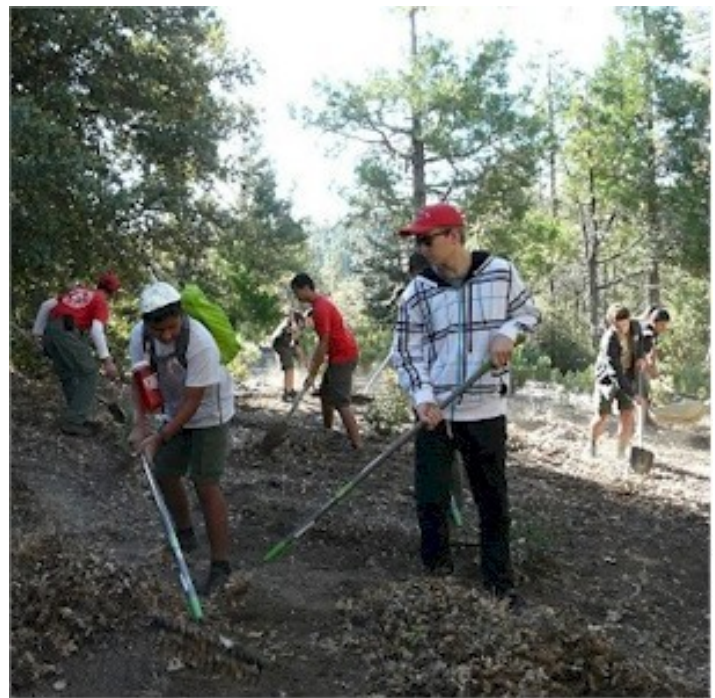
Service Project: Preparing the site for the new Camp Emerson Chapel.