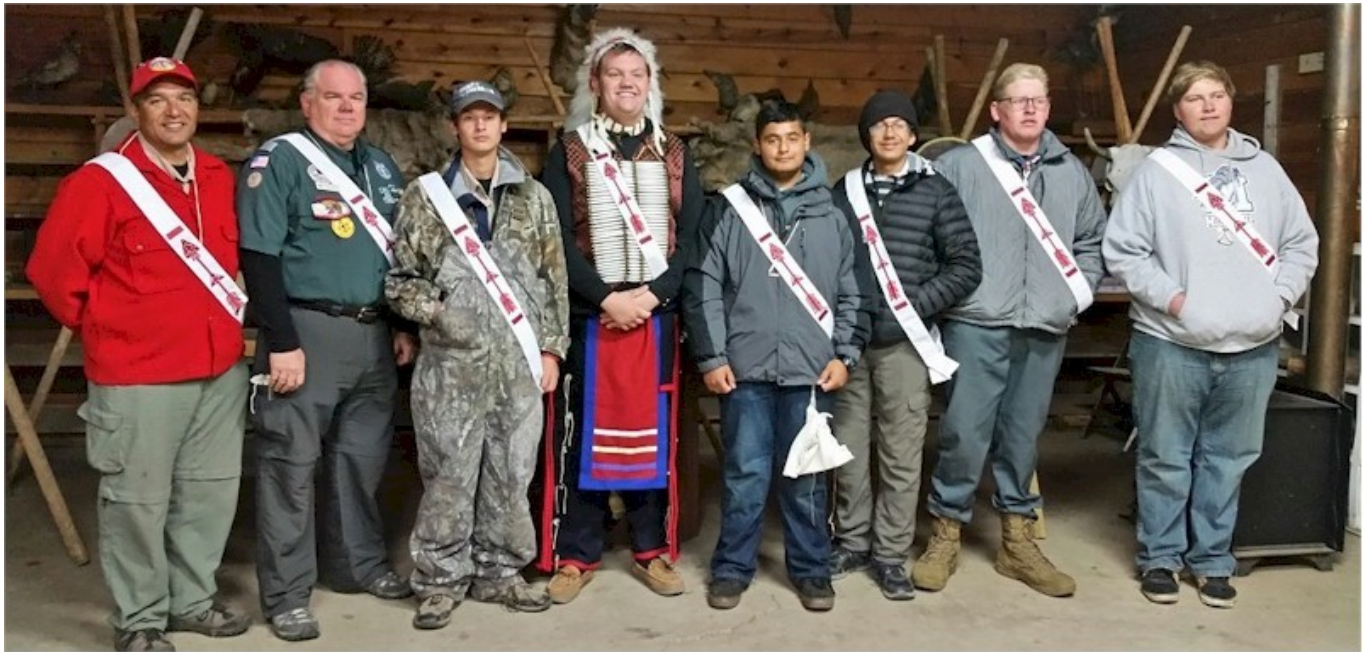
The Vigil Honor Class of 2016